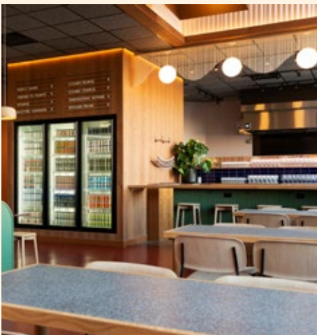
→ LIFE ON MARZ