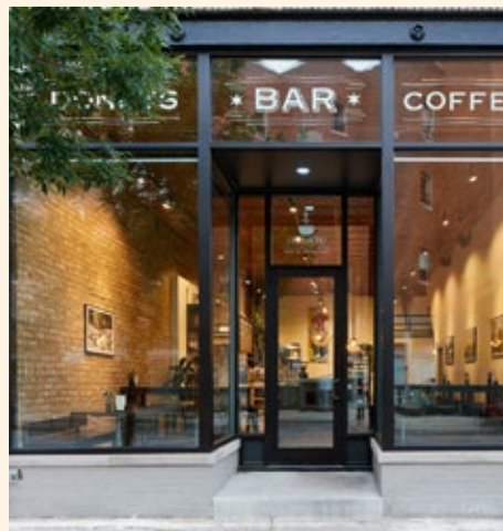
→ IPSENTO COFFEE