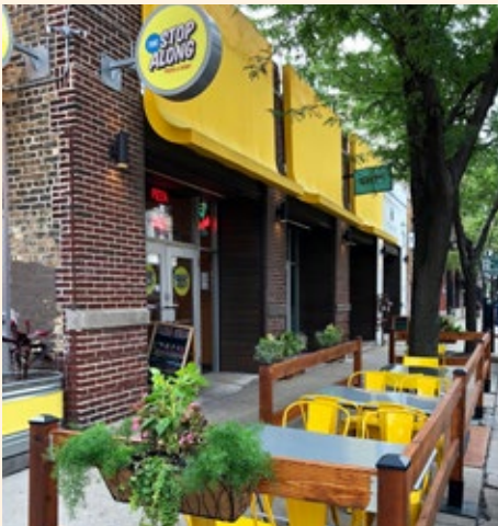
→ THE STOP ALONG