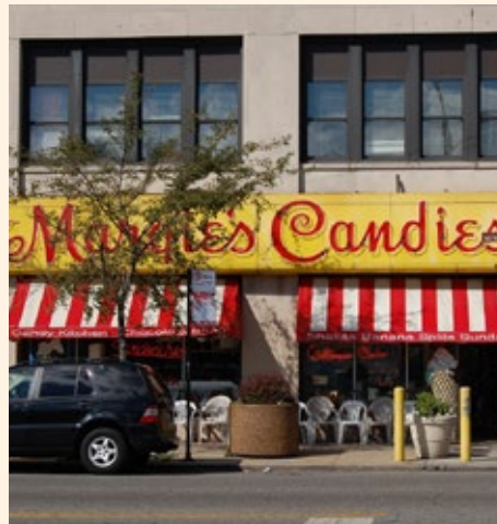
→ MARGIE'S CANDIES