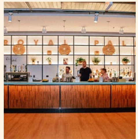
→ ROYAL PALMS