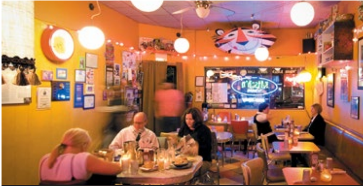
KITSCH'N ON ROSCOE