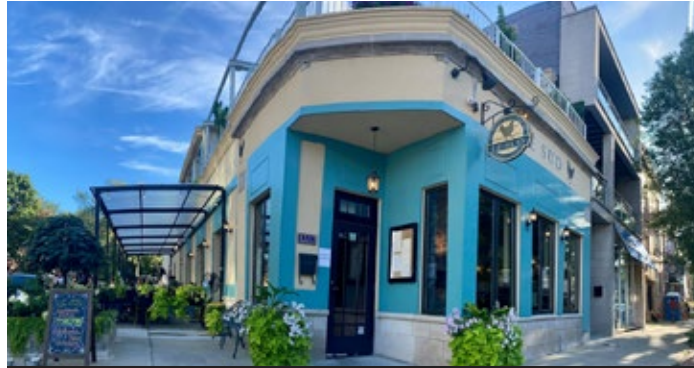
LE SUD MEDITERRANEAN KITCHEN