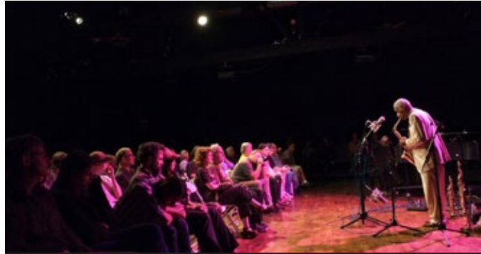
CONSTELLATION MUSIC & PERFORMANCE SPACE CHICAGO