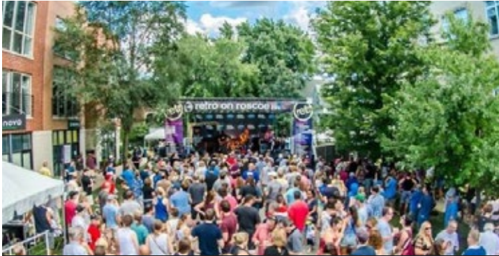
RETRO ON ROSCOE ANNUAL STREET FESTIVAL