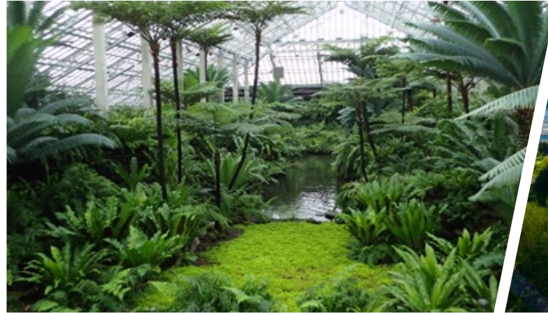
Garfield Park Conservatory 2 minutes from 3333 W. Lake Street

Ongoing redevelopment projects and investment initiatives also continue to attract businesses and improve infrastructure, fostering a bright future for this dynamic neighborhood.