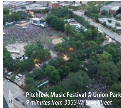
Pitchfork Music Festival @ Union Park 9 minutes from 3333 W. Lake Street