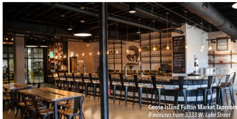
Goose Island Fulton Market Taproom 8 minutes from 3333 W. Lake Street