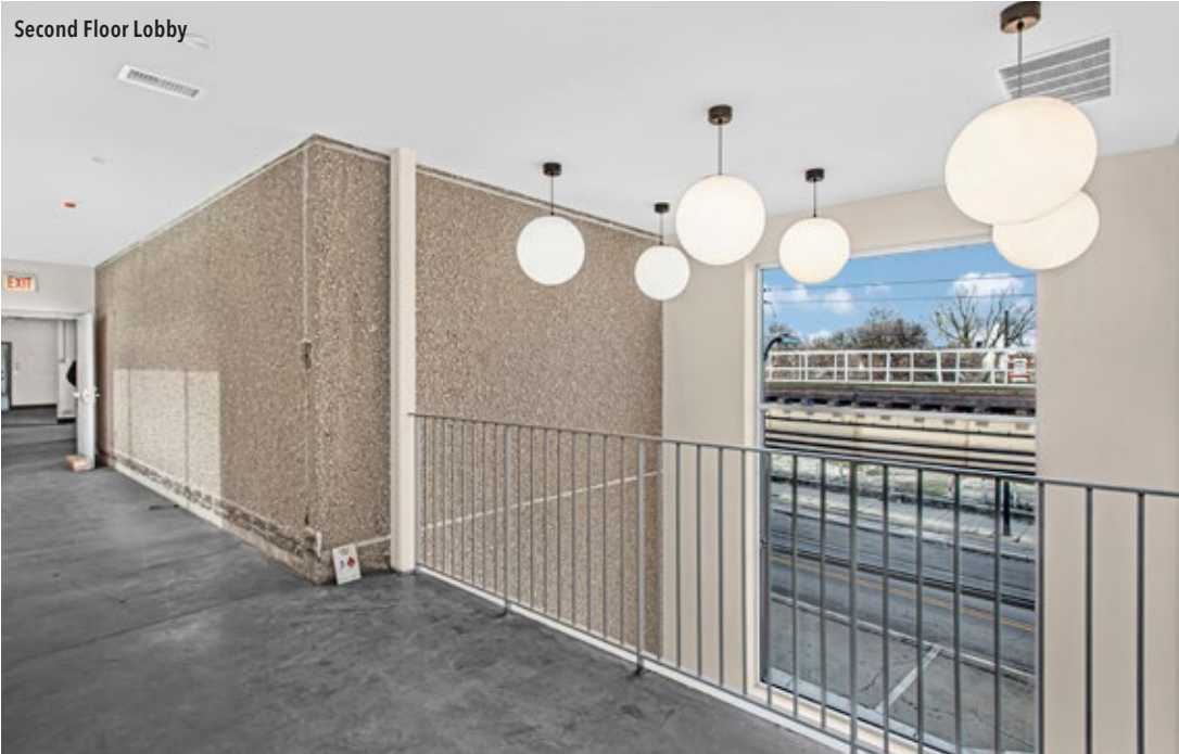
Second Floor Lobby