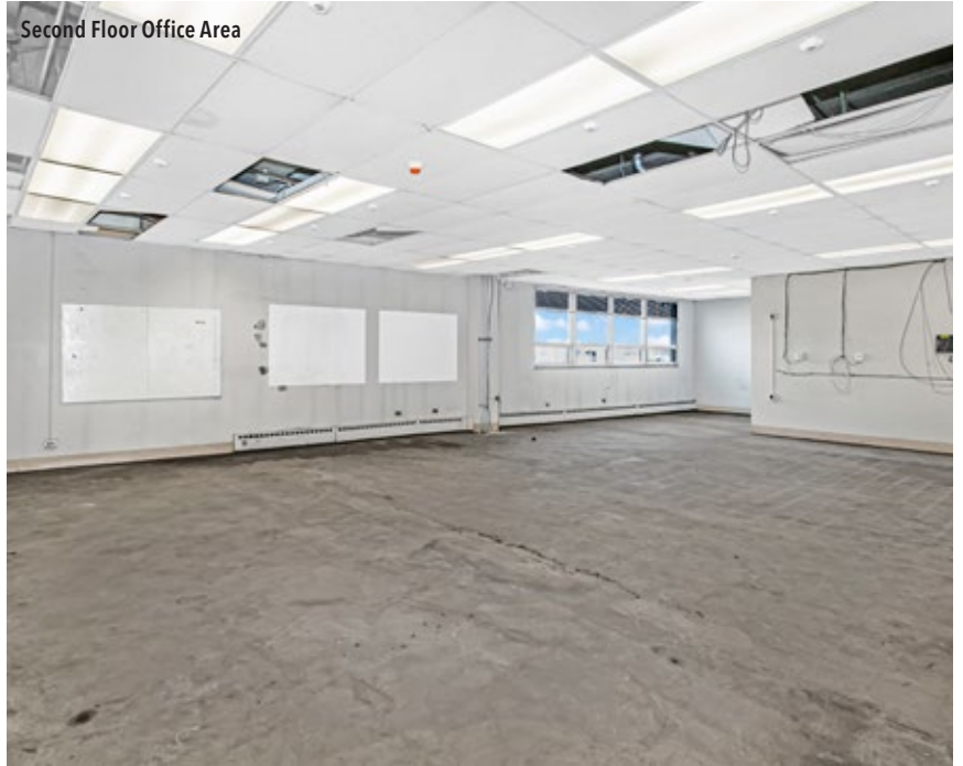
Second Floor Office Area