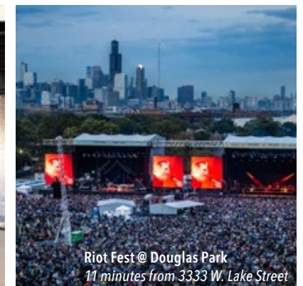
Riot Fest @ Douglas Park 11 minutes from 3333 W. Lake Street