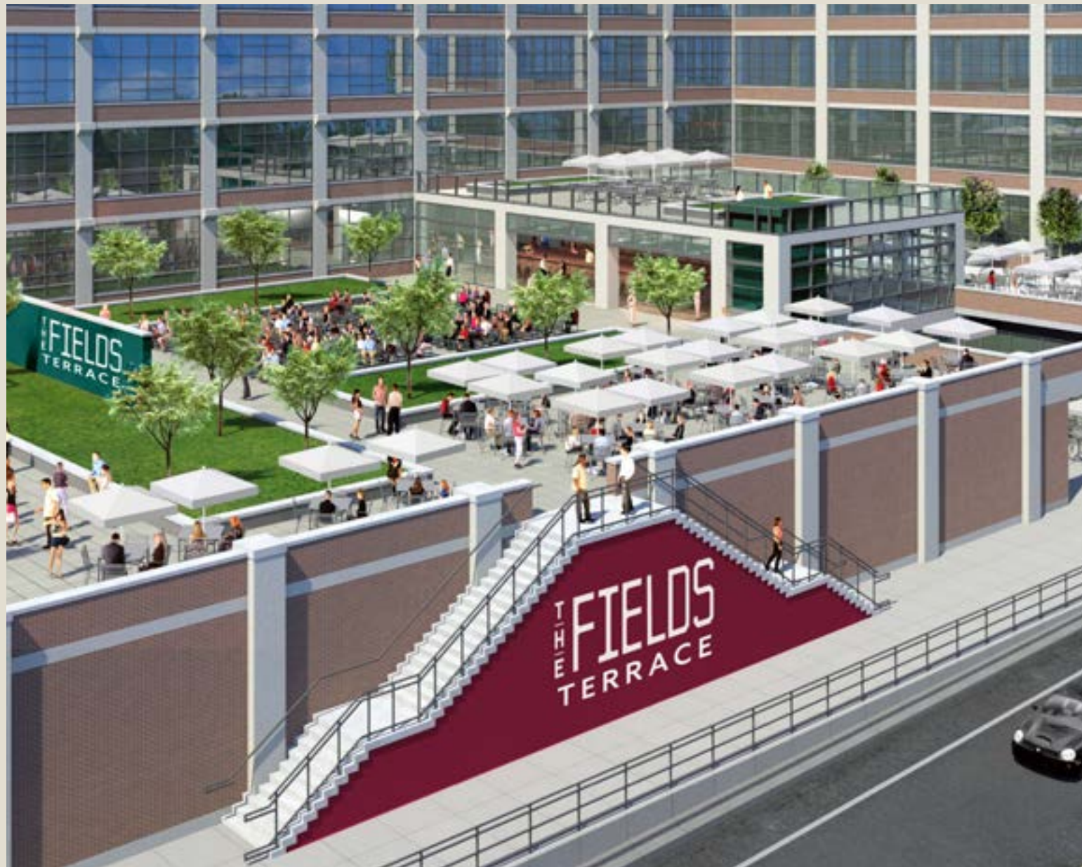
ABOVE: RETAIL CORRIDOR, BELOW: D2 ROOF DECK