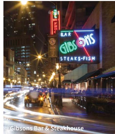
Gibsons Bar & Steakhouse