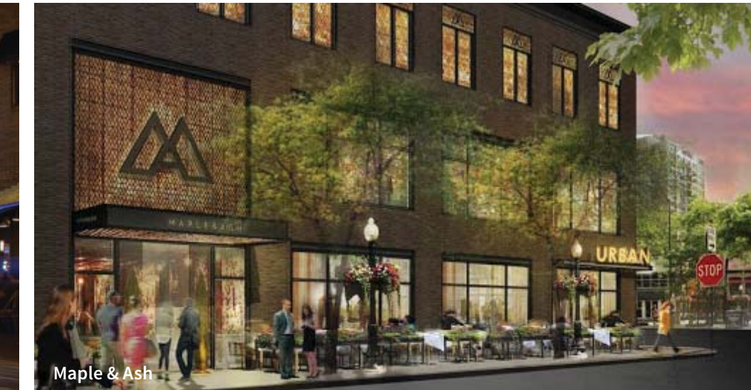
Maple & Ash