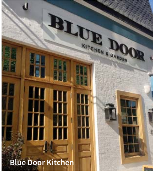
Blue Door Kitchen