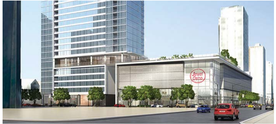
The Sinclair 390-unit luxury residence with 58,000 SF retail