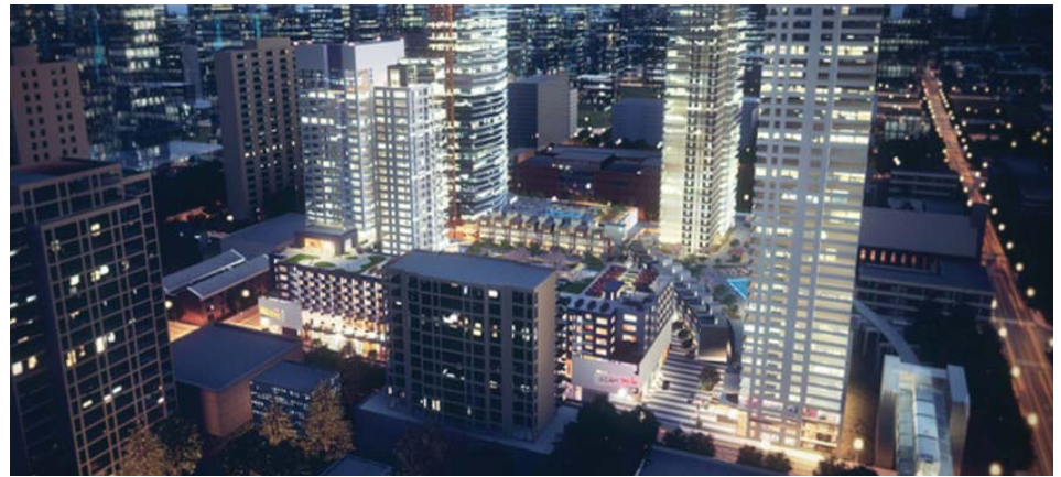
Atrium Village Urban Renewal Project 1,500 residential units and 47,000 SF retail