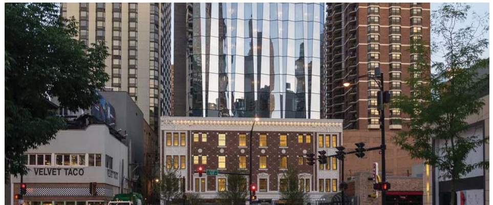
The Viceroy Hotel 180 room boutique hotel