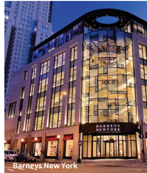
Barneys New York

An abundance of nightlife keeps the Gold Coast lively after retail hours. Offerings range from classic Chicago steakhouses and award winning fine dining restaurants, including the Michelin-starred Spiaggia and James Beard award winner Nico Osteria, to sophisticated cocktail bars and vibrant upscale nightclubs featuring world-class entertainment.