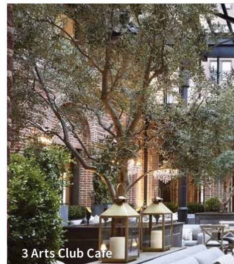
3 Arts Club Cafe