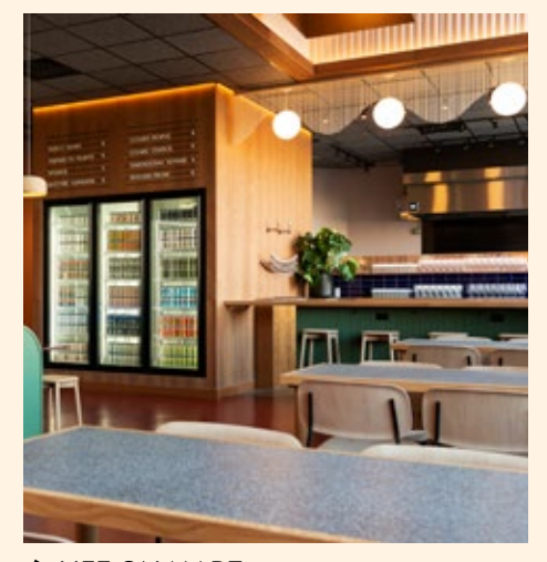
→ LIFE ON MARZ