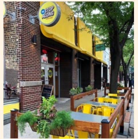
→ THE STOP ALONG