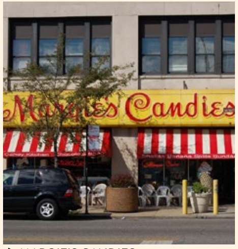
→ MARGIE'S CANDIES