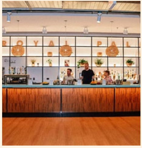
→ ROYAL PALMS