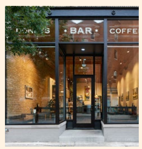
→ IPSENTO COFFEE