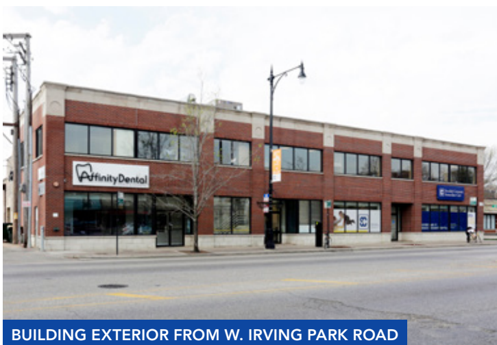
BUILDING EXTERIOR FROM W. IRVING PARK ROAD