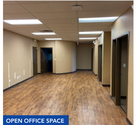
OPEN OFFICE SPACE