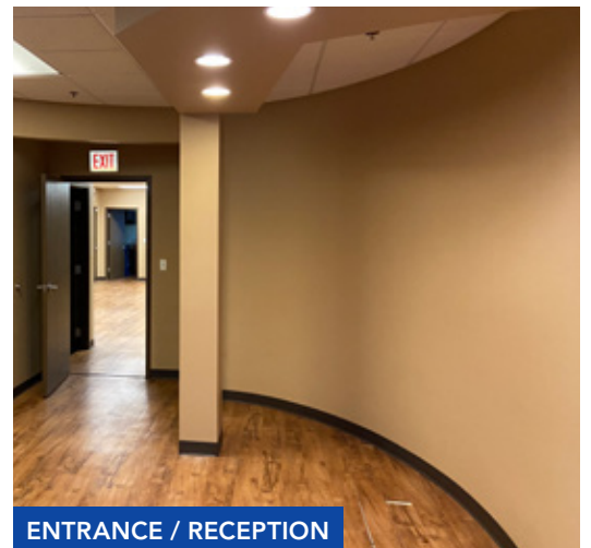
ENTRANCE / RECEPTION