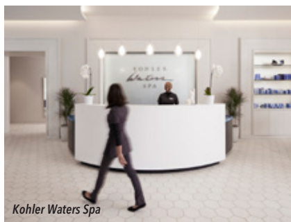
Kohler Waters Spa