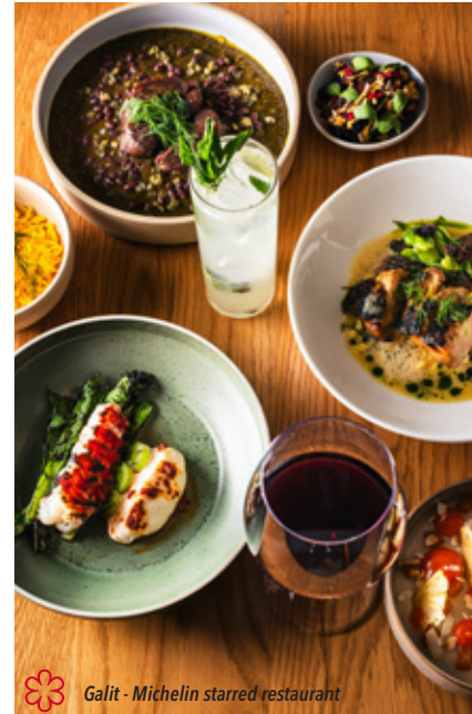
Galit - Michelin starred restaurant