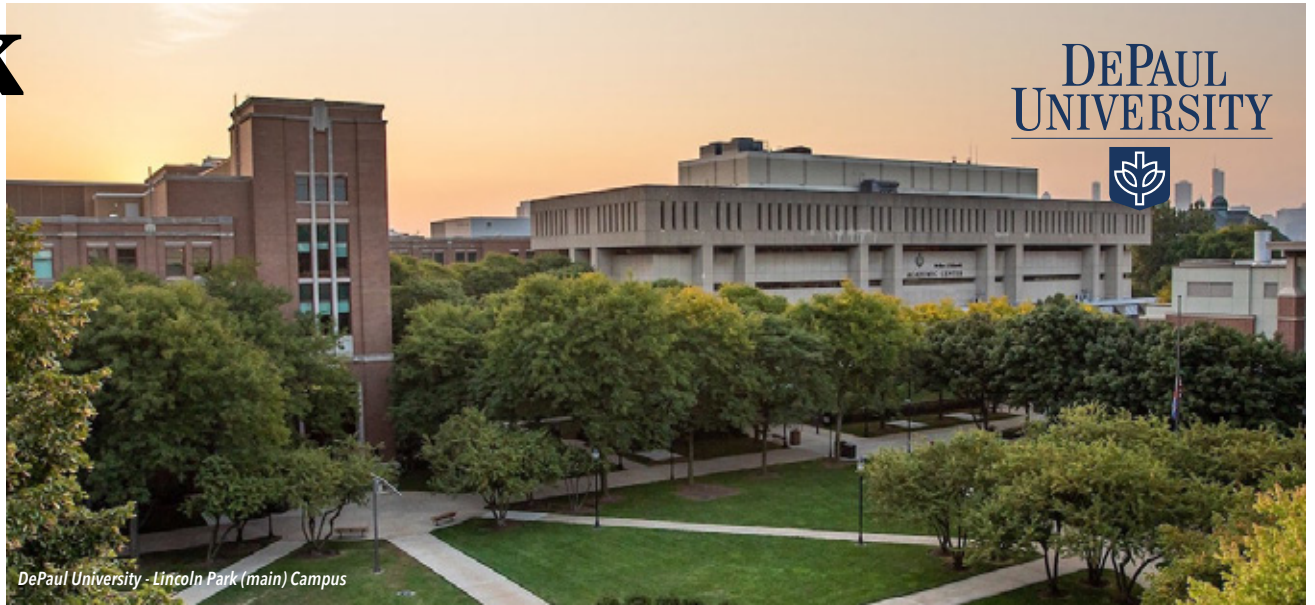
DePaul University - Lincoln Park (main) Campus

This prime location is surrounded by cultural, culinary, and retail attractions, including Michelin-starred Galit, which draws food enthusiasts from across the city with its innovative Middle Eastern cuisine. Just steps away, DePaul University brings youthful energy and a steady flow of students, faculty, and visitors who frequent the area's eclectic mix of cafes, boutiques, and everyday conveniences. The nearby Kohler Waters Spa adds a touch of luxury to the neighborhood, offering an upscale destination for relaxation and wellness. Together, the entertainment, dining, and retail options along this stretch make Lincoln Avenue a dynamic hub in Lincoln Park, where culture, commerce, and community seamlessly converge.