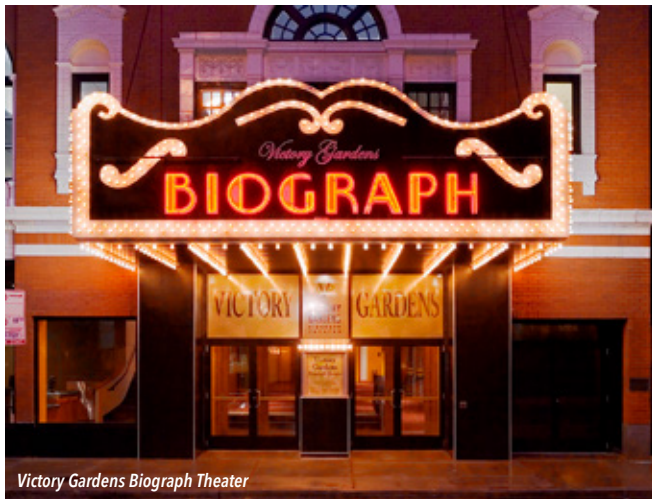
Victory Gardens Biograph Theater