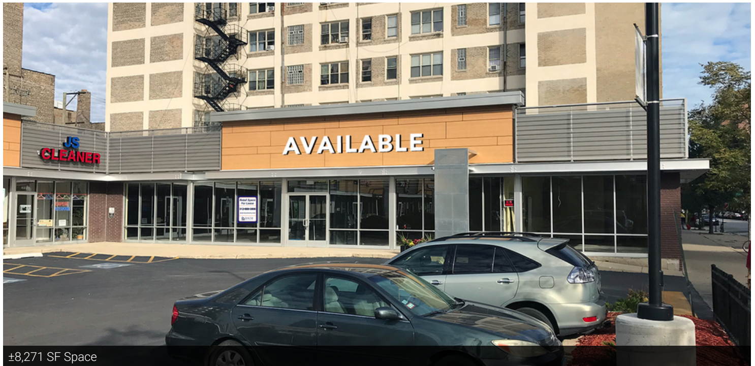
±8,271 SF Space