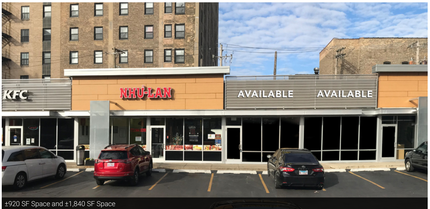
±920 SF Space and ±1,840 SF Space