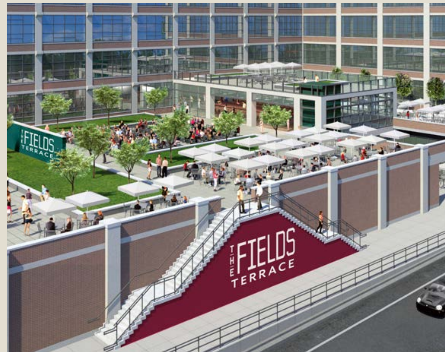
ABOVE: RETAIL CORRIDOR, BELOW: D2 ROOF DECK