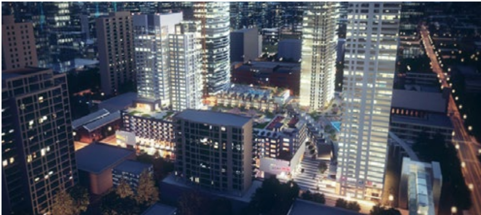
ATRIUM VILLAGE URBAN RENEWAL PROJECT 1,500 residential units and 47,000 SF retail