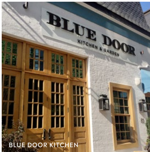
BLUE DOOR KITCHEN