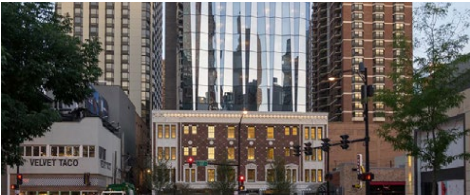
THE VICEROY HOTEL 180 room boutique hotel