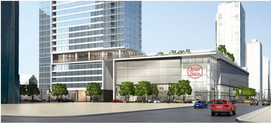
THE SINCLAIR 390-unit luxury residence with 58,000 SF retail