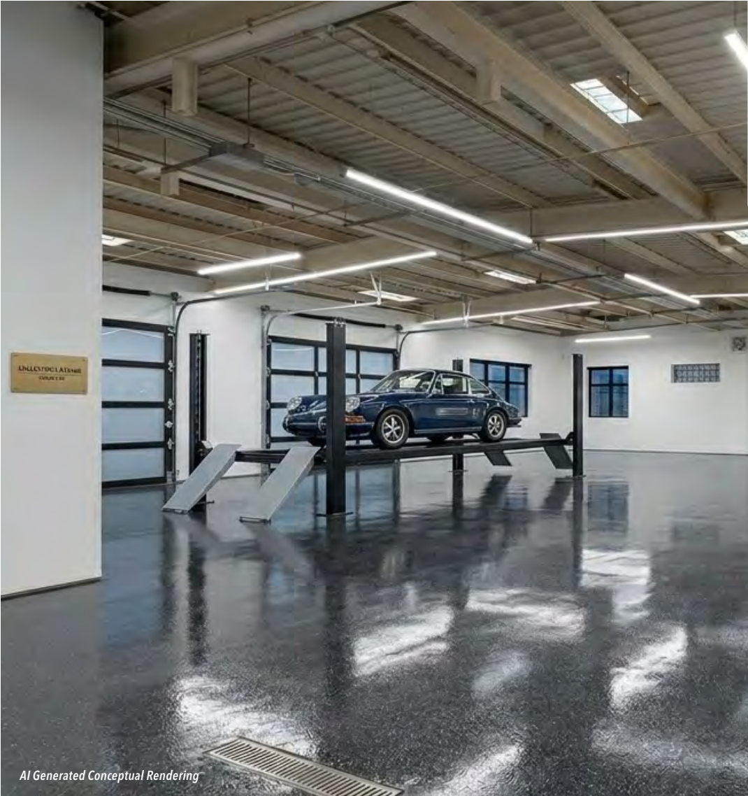
AI Generated Conceptual Rendering