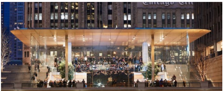
APPLE FLAGSHIP MICHIGAN AVENUE STORE - 0.2 MILE FROM 200 E. ILLINOIS