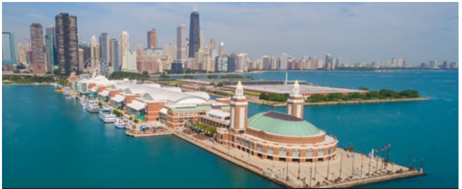
NAVY PIER - 0.5 MILE FROM 200 E. ILLINOIS