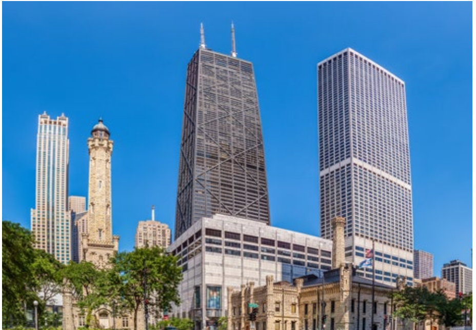
WATERTOWER PLACE & 875 N. CHICAGO - 0.5 MILE FROM 200 E. ILLINOIS