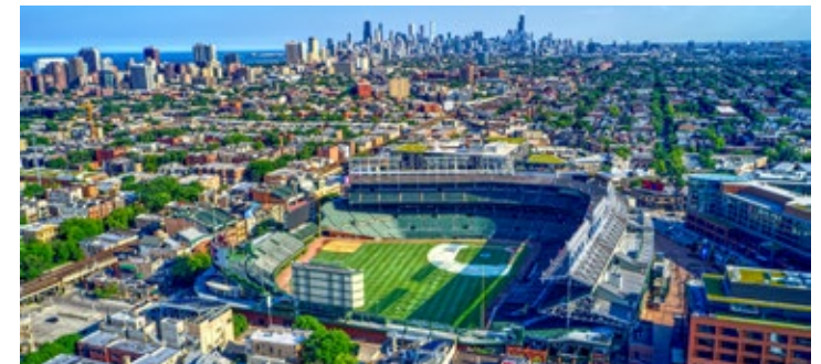
Wrigley Field (5 minutes south of 4400 N. Clark Street)

ARI TOPPER, CFA 312.275.3113 ari@baumrealty.com