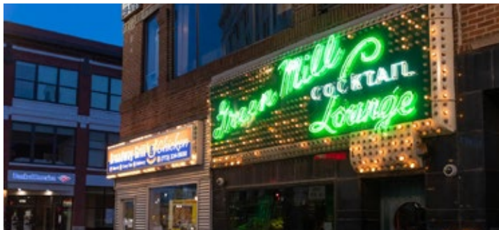
The Green Mill (5 minutes northeast of 4400 N. Clark Street)

Less than a mile south, Wrigley Field, home of the Chicago Cubs, and the surrounding entertainment district host a variety of sporting events, live music, festivals, and more, providing abundant year-round entertainment and nightlife options for both locals and tourists.