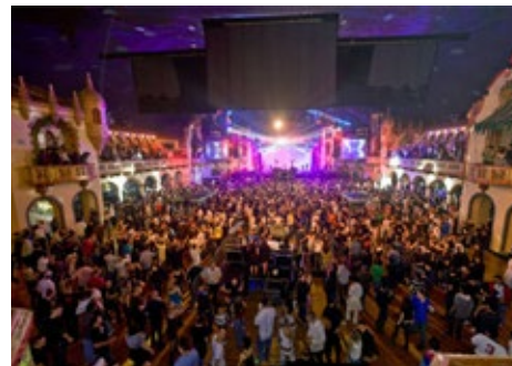
Aragon Ballroom (5 minutes northeast of 4400 N. Clark Street)