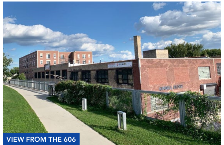
VIEW FROM THE 606

ARI TOPPER, CFA ari@baumrealty.com 312.275.3113