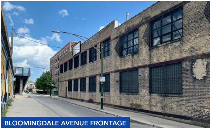
BLOOMINGDALE AVENUE FRONTAGE