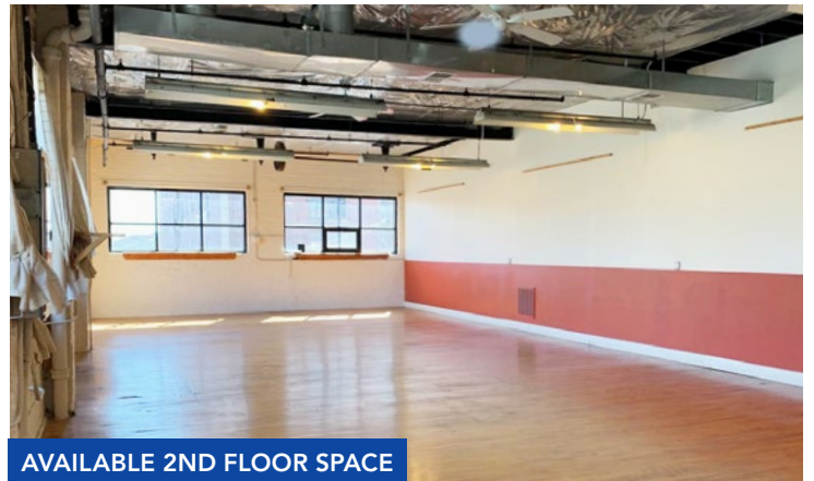
AVAILABLE 2ND FLOOR SPACE