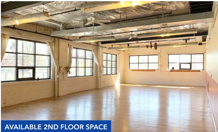
AVAILABLE 2ND FLOOR SPACE