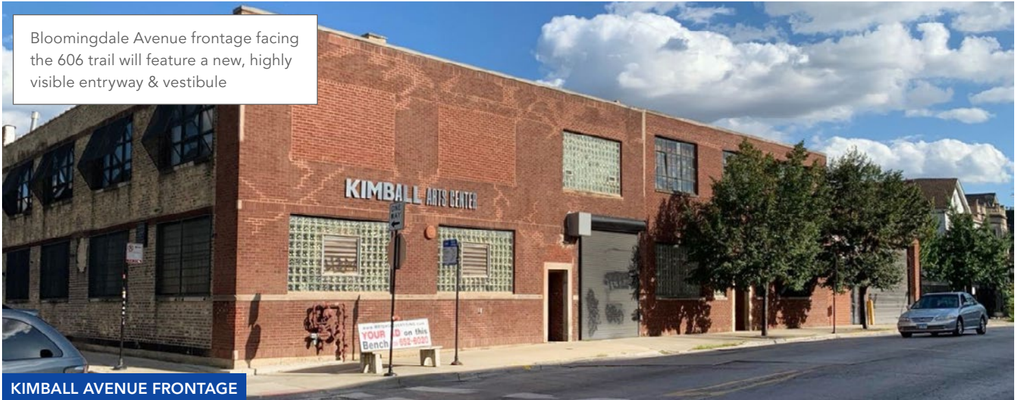
KIMBALL AVENUE FRONTAGE

Bloomington Avenue frontage facing the 606 trail will feature a new, highly visible entryway & vestibule