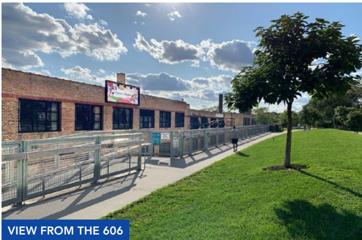
VIEW FROM THE 606